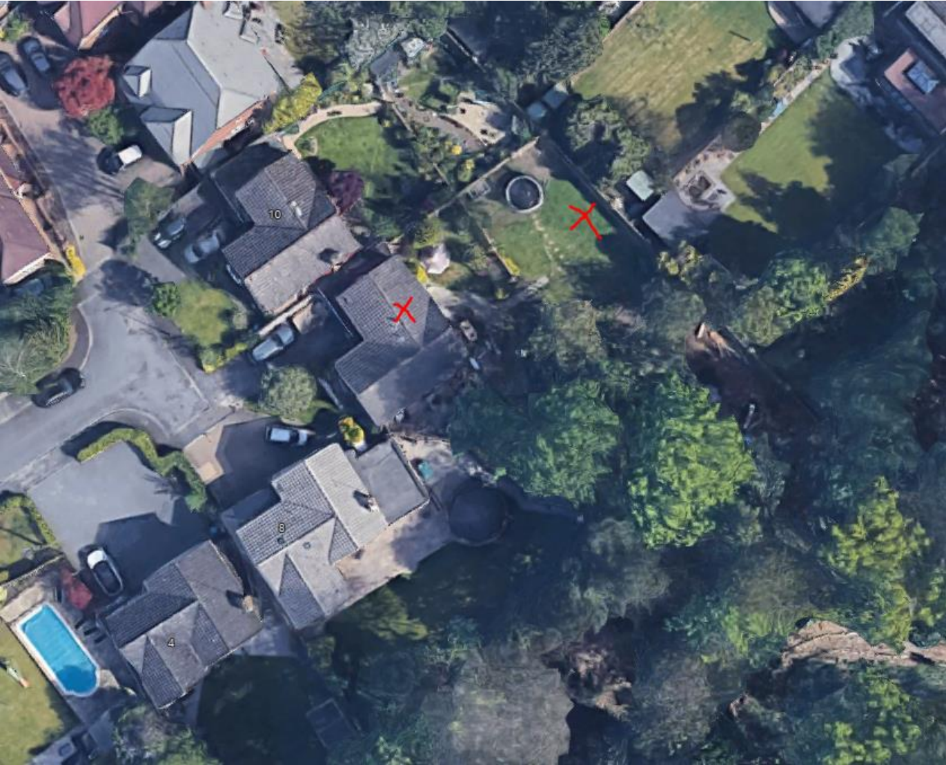
Aerial view of site